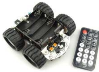
4WD MiniQ Complete Kit V1 (SKU:ROB0050)