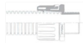
Conduit complete with FPA fitting